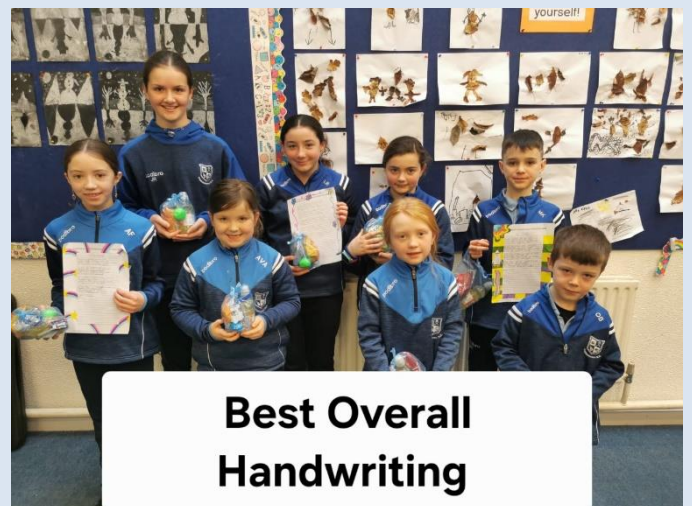
Best Overall Handwriting

All children in the school took part in a school handwriting competition in January. There were 3 categories that the children could win prizes in. Congratulations and well done to all.