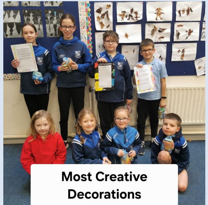
Most Creative Decorations