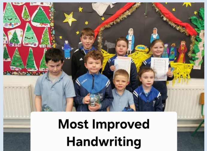
Most Improved Handwriting