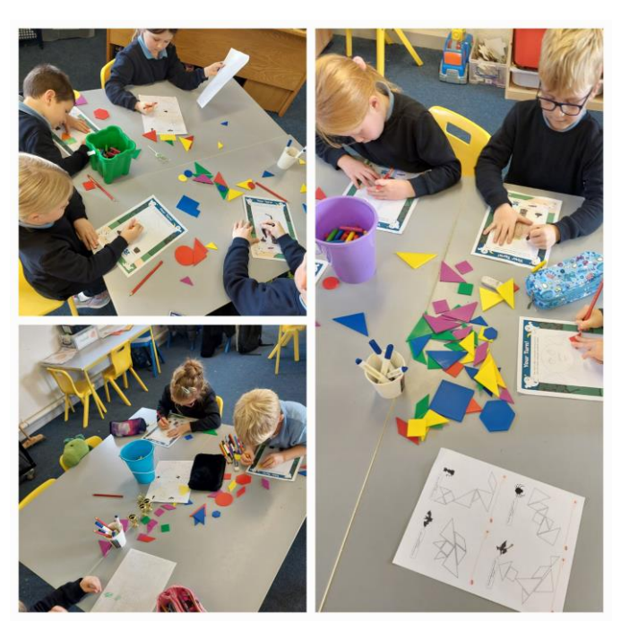
Using tangrams to make art in Senior infants.