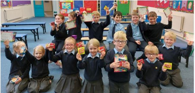
Winners of class prizes for efforts in Maths were awarded in a special Maths Assmebly.