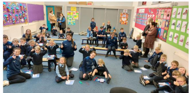
Whole school Bingo.