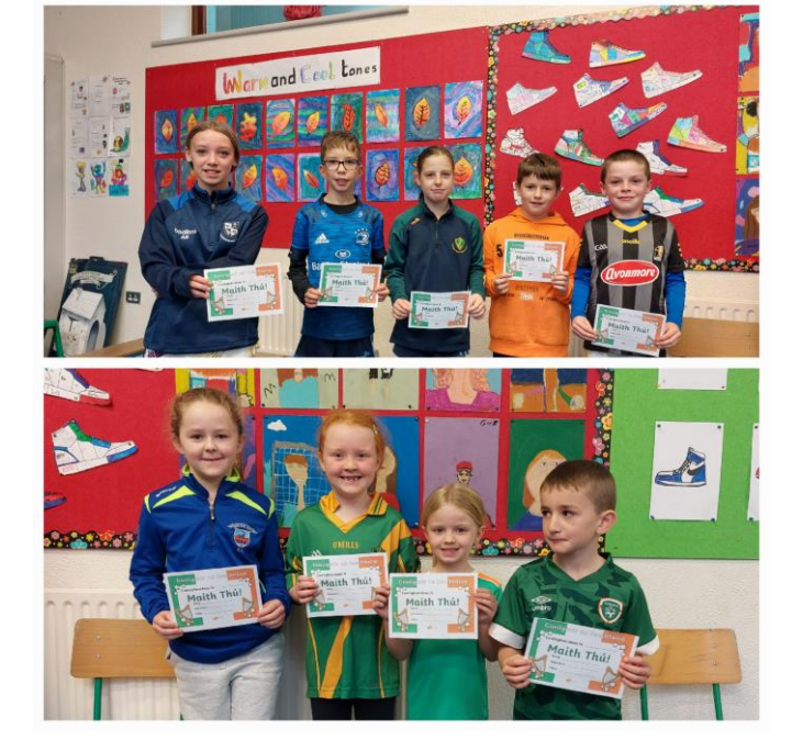
Gaeilgeoir na Seachtaine buaiteoirí duaise.