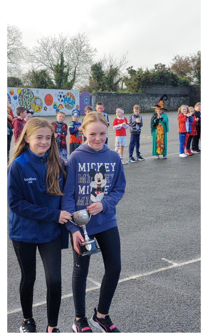
Parading our Rackard League District final trophy.